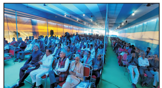
Presence of more than 1400 delegates and more than 150 dignitaries in the event