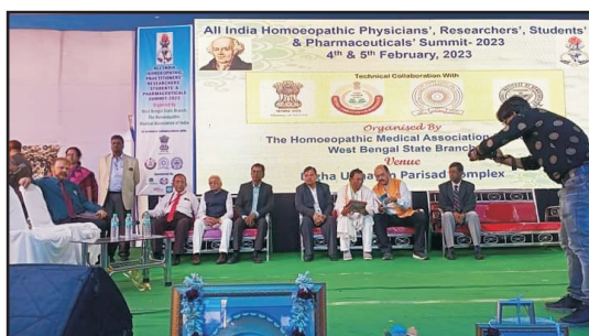
Sri. Akhil Giri, Hon'ble Minister of State, Minister of Correctional Administration Investigation & Development